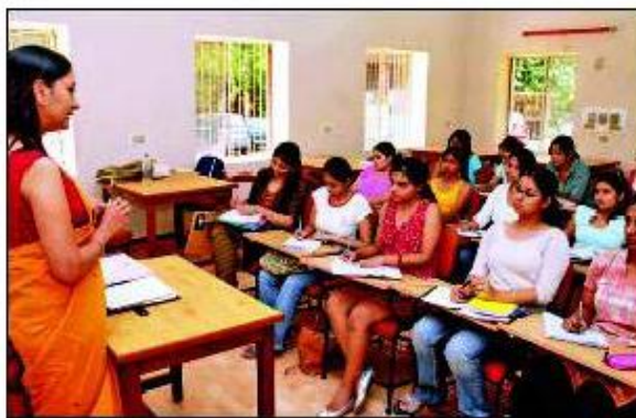
LONG WAIT: About 4,000 permanent posts are lying vacant

In the final meeting of the review committee on the teachers' promotion, where apart from UGC members, heads and vice chancellors of various universities were also present, its final recom-