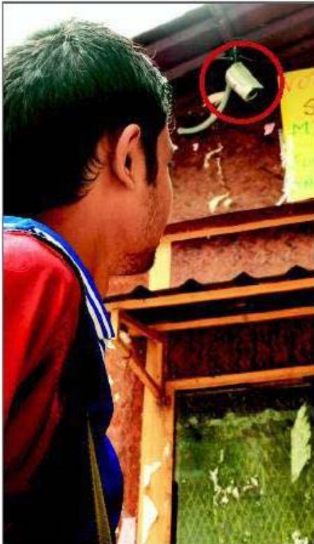
The camera outside DCAC's canteen area