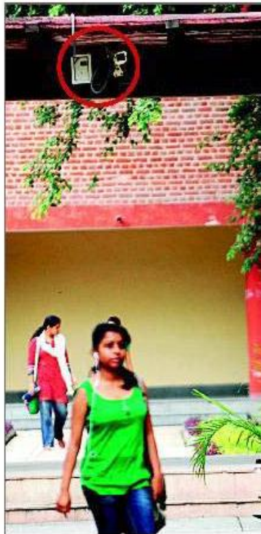
A CCTV cam located outside Miranda House college's main gate

D elhi University authorities had started the new academic session on a great note by announcing the installation of CCTV cameras in colleges and other popular landmarks on campus. But after the molestation incident reported during the pre-election campaigning rallies, questions on student safety were raised once again.